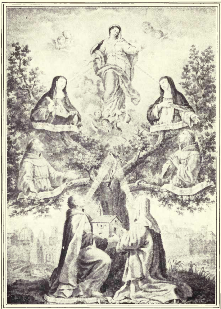
THE FATHER AND MOTHER, AS WELL AS THE TWO BROTHERS AND THE SISTER, OF MARY OF AGREDA ENTERED RELIGION ABOUT THE YEAR 1617.